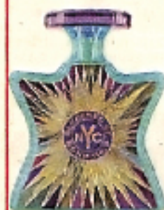
Bond No 9, £140, Harvey Nichols , 020 7235 5000