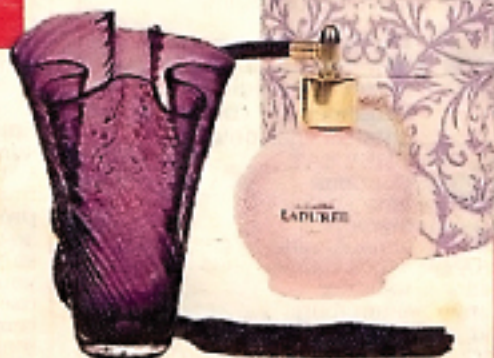
Lilac vase, £32, LSA International , 01932 789721 Caprice perfume, £35, Laduree , 020 7491 9155