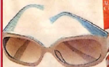
Sunglasses, £49, Boden , 0845 677 5000