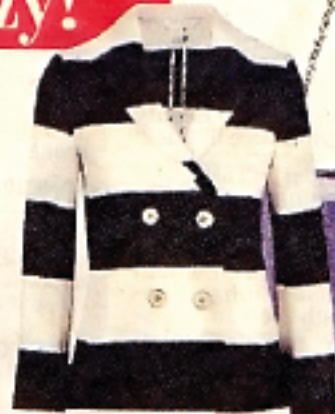
Striped double-breasted blazer, £521, DVF at www.matchesfashion.com