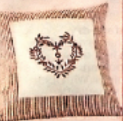
Embroidered cushion, £22.52, www.lavenderandsage.com , 0845 601 0422