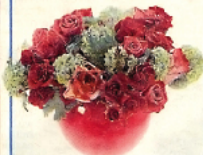
Pot with pink roses, £75, Atelier Mayer , www.atelier-mayer.com