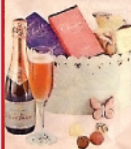
Mothering Sunday gift set, £50, Fortnum & Mason , 0845 300 1707