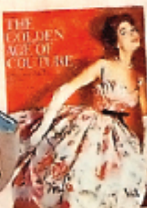
Couture book £24.99, www.vandashop.com , 020 79422696