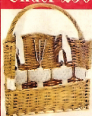
Gardening tools in basket, £35, Laura Ashley , 020 7880 5100