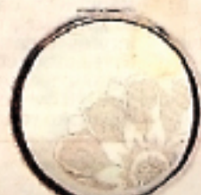
Compact mirror, £49, Thomas Lyte , 020 7751 8844