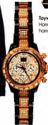
Toywatch watch Harrods from (£229) harrods.com