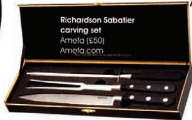
Richardson Sabatier carving set Amefa (£50) Amefa.com