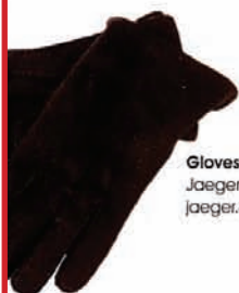
Gloves Jaeger (£80) jaeger.com