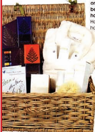
Origins organic beauty hamper Harrods (£175) harrods.com