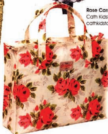
Rose Carry All bag Cath Kidston (£25) cathkidston.co.uk