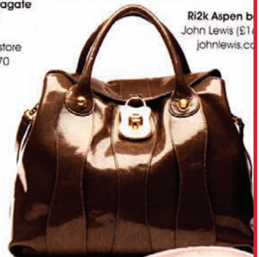
Ri2k Aspen bag John Lewis (£170) johnlewis.com