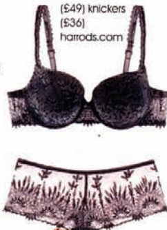
Chanelle Africa Python lingerie Harrods bra (£49) knickers (£36) harrods.com