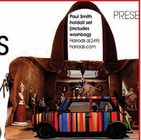
Paul Smith holdall set (includes washbag) Harrods (£249) harrods.com