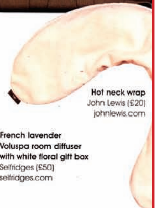
Hot neck wrap John Lewis (£20) johnlewis.com