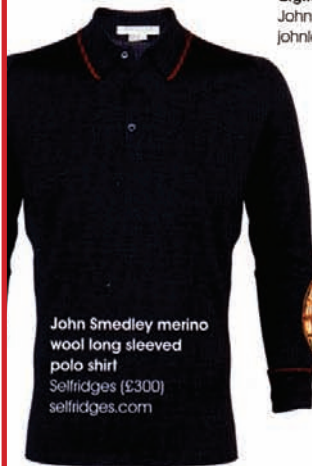
John Smedley merino wool long sleeved polo shirt Selfridges (£300) selfridges.com