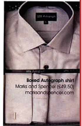
Boxed Autograph shirt Marks and Spencer (£49.50) marksandspencer.com