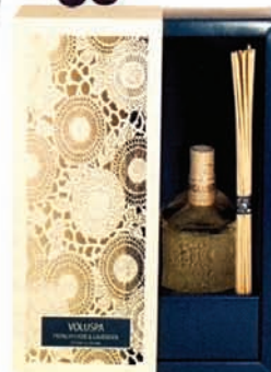
French lavender Voluspa room diffuser with white floral gift box Selfridges (£50) selfridges.com